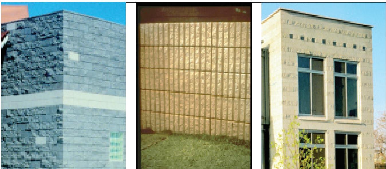
(a) Split Face and Glazed

Split-faced units can also be manufactured with ribs or scores to provide strong vertical lines in the finished wall. Rough textures, like those available with split face units, are often used in areas prone to graffiti, as the texture tends to discourage graffiti vandals.