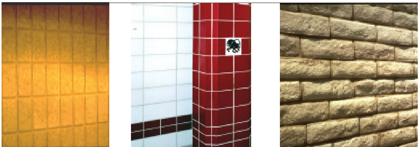
(a) Scored and Ground Face

Sand (or abrasive) blasting is used to expose the aggregate in a concrete masonry unit and results in a "weathered" look.